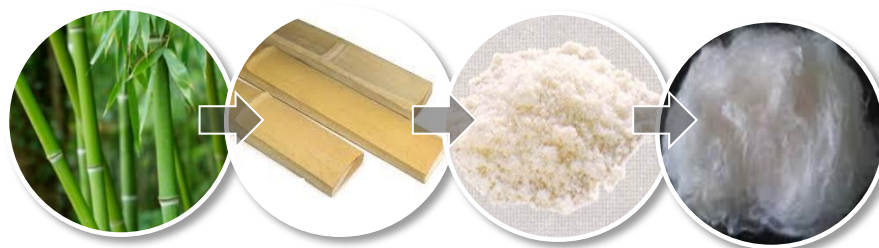
Dissolve bamboos, extract bamboo cellulose, comb out bamboo fibers