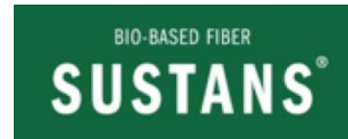
Sustans®/Cotton & Spandex/Cotton Elasticity Recovery Rate Comparison